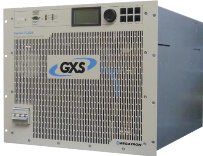
TC.GXS Series unit with optional Human Machine Interface (HMI)