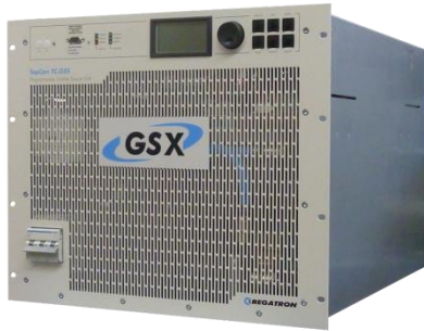
TC.GSX Series unit with optional Human Machine Interface (HMI)